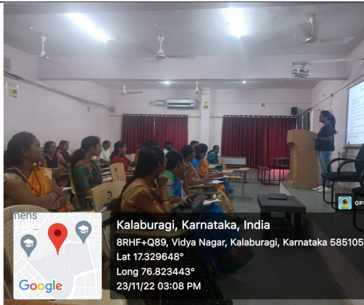
Figure-3-Session conduction by Dr.Balalakshmi