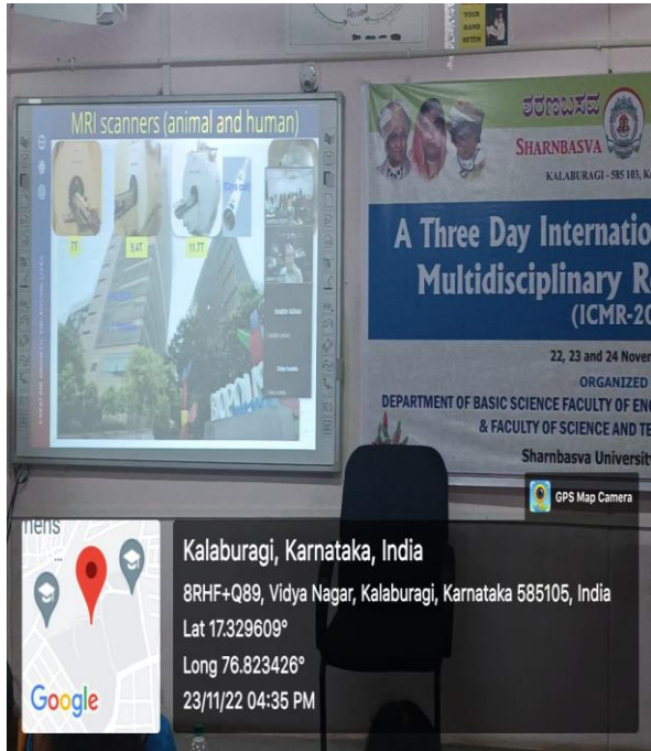
Figure-5-Session conduction by Dr.Jadesha Yaligar