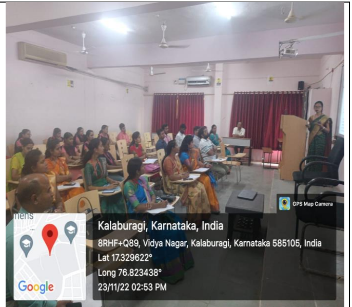
Figure-2-Session conduction by Mrs.Priyanka Vishwanath Kalyan